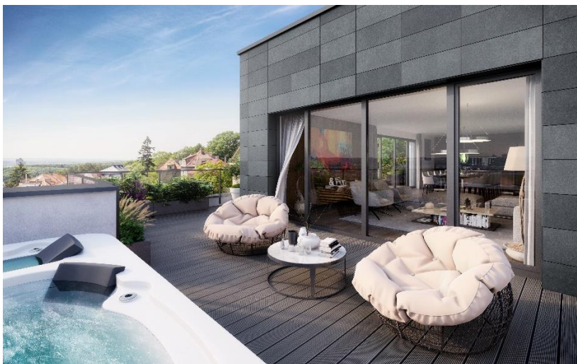
The private terrace offers many options. The flat owner can install for example a jacuzzi or a private sauna.