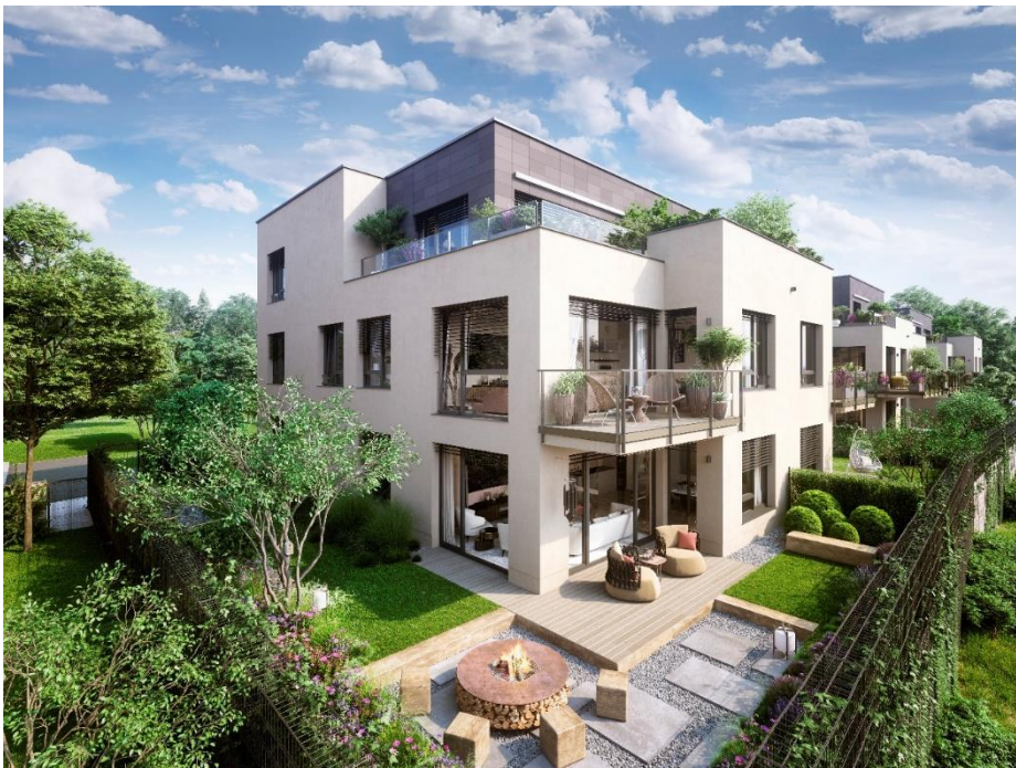
Exterior visualization of Čertův vršek

Photo gallery: Download all the photos in high quality by clicking here