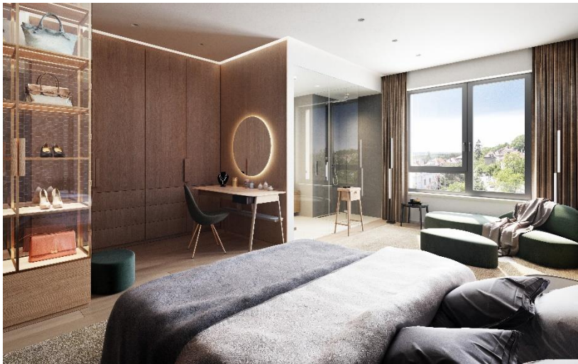
Interior visualization of Čertův vršek